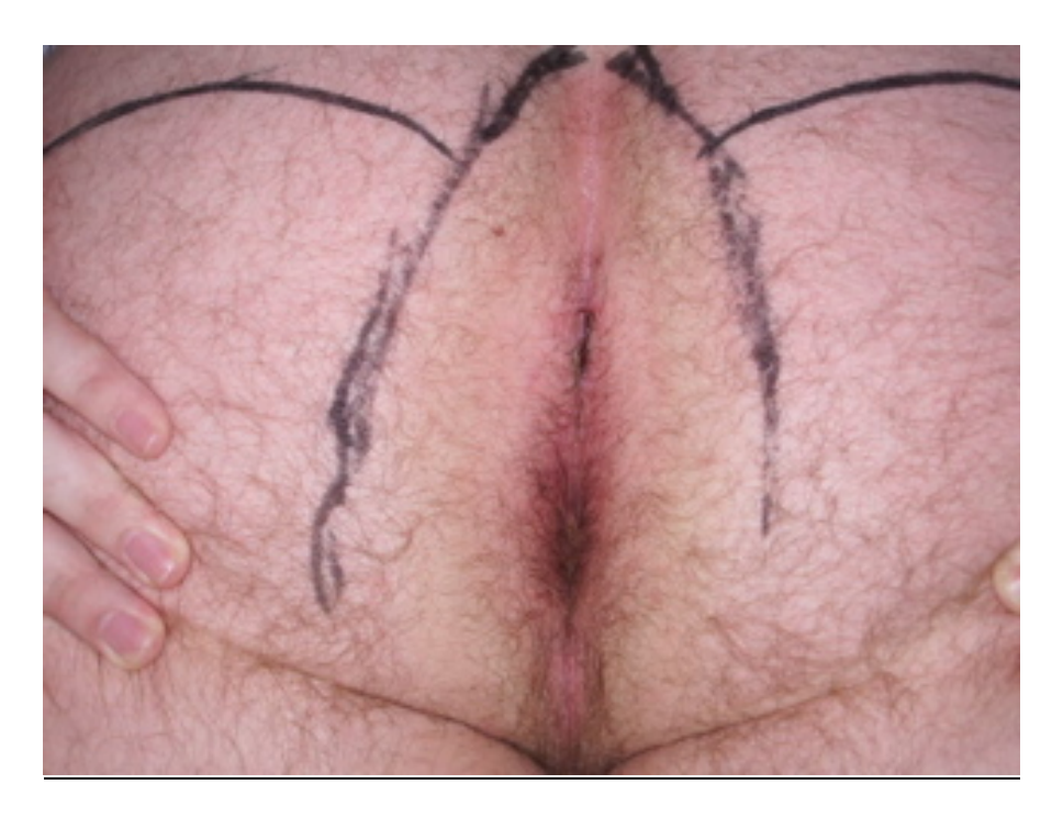
This photo shows what I need for photo 2

Congratulations! You're done. Nail polish remover should take the ink off.